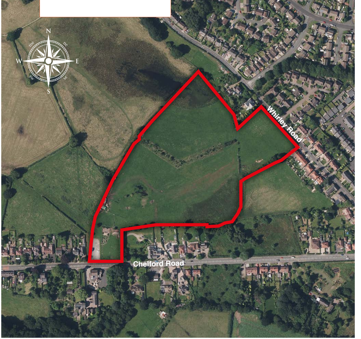
The application site boundary