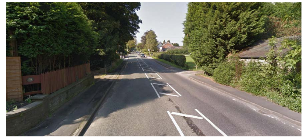
View of the site along Chelford Road